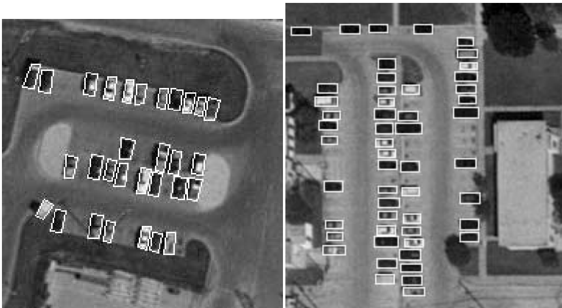
Figure 1. Segments of the annotated image with manually delineated vehicle outer boundaries.

it is actually also of very much interest to developing a vehicle detector — it provides negative training samples.